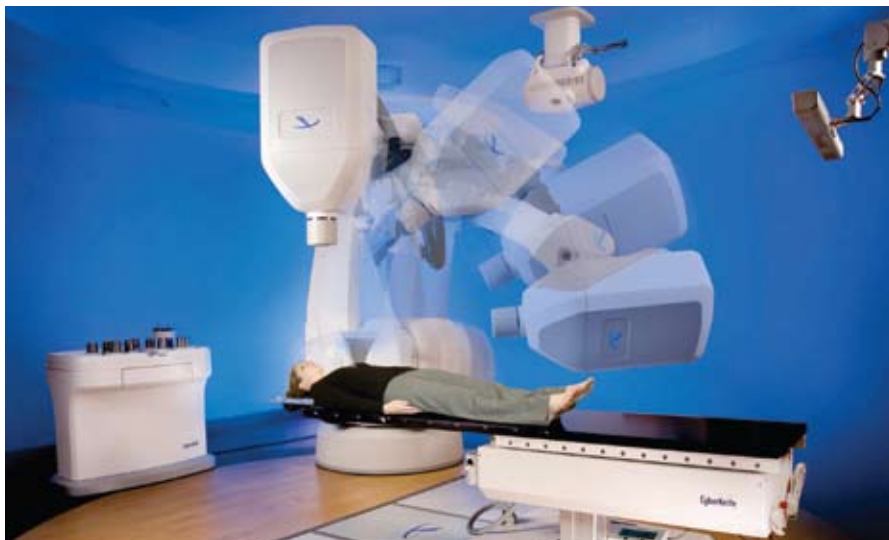
CyberKnife® Robotic Radiosurgery System