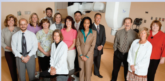
The team at CyberKnife Center of Chicago

Elmhurst Memorial Hospital Radiation Oncology Department 200 Berteau Avenue | Elmhurst, Illinois 60126 630-758-5588 | ChicagoCK.com