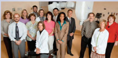
The team at CyberKnife Center of Chicago

Elmhurst Memorial Hospital Radiation Oncology Department 200 Berneau Avenue | Elmhurst, Illinois 60126 630-758-5588 | ChicagoCK.com